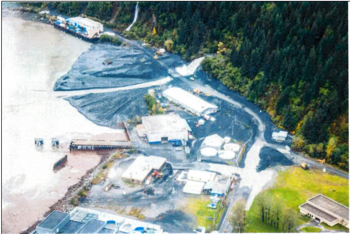
Figure 2. Existing Lowell Creek outfall terminus

In 2016, USACE developed an Environmental Analysis and subsequently issued a Finding of No Significant Impact for maintenance actions necessary to the longevity of the existing Lowell Creek flood control structures. Maintenance actions were conducted in mid-winter to avoid surface flows that might preclude repair actions. Due to the project footprint (the majority of work occurring within the Lowell Creek Tunnel, and previously disturbed and paved areas used as laydown sites), the type of work being conducted, and specific timing of the repair actions, impacts to threatened and endangered species, bald and golden eagles, and migratory birds were not reasonably expected to occur. Similarly, downstream effects of such work were negligible and were not anticipated to impact anadromous waters, essential fish habitat, marine mammals, or threatened or endangered species and their respective critical habitats.